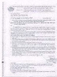
CMOs Releases.jpg 176K